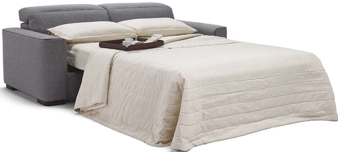
■ Vers. 264