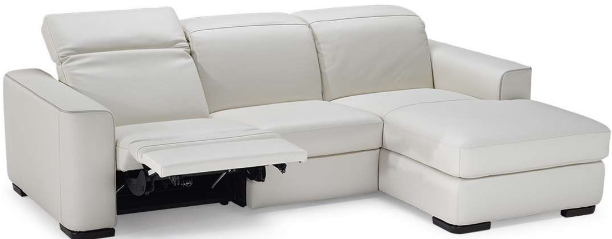
■ Vers. 182+049