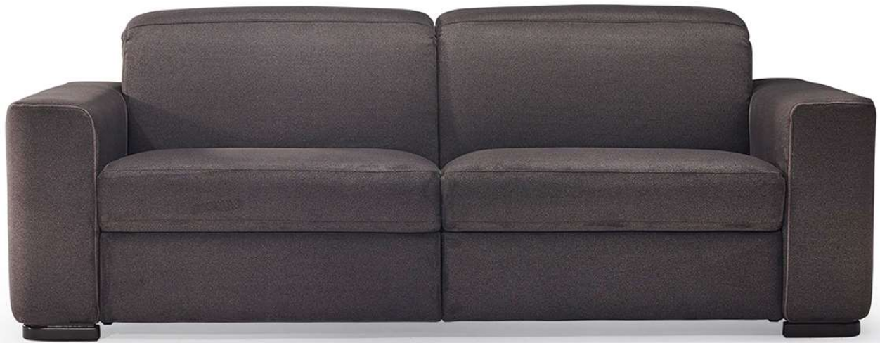
■ Vers. 446